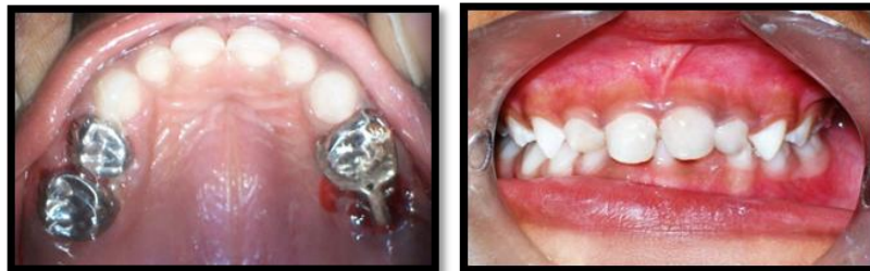
Treatment under General anaesthesia